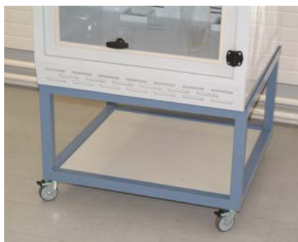
Trolley for CAS30

Manufactured according to OSHA und ANSI Z9.5 standards: