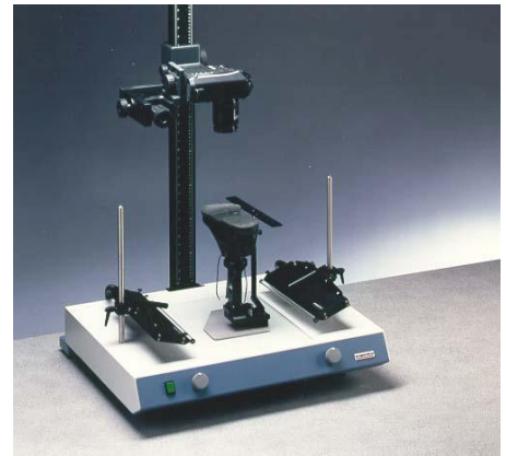
Fig.: Foto Light Box with shoe holder