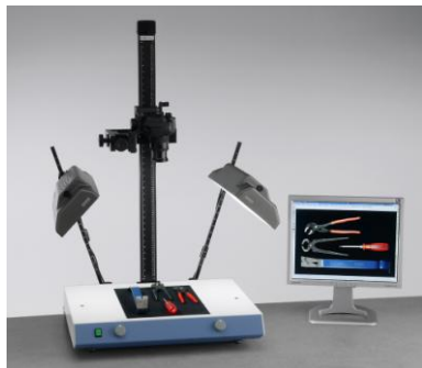
Fig.: Foto Light Box with RB5000 Repro illumination