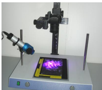
Fig.: Foto Light Box with CSL-700 lamp